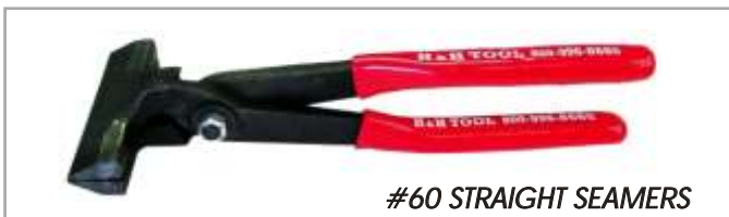
#60 STRAIGHT SEAMERS