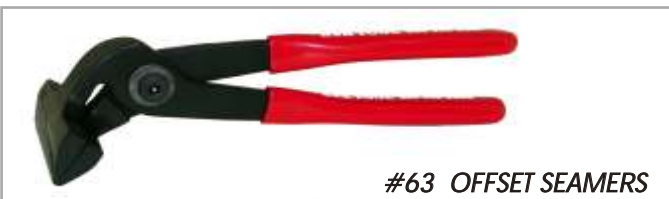
#63 OFFSET SEAMERS