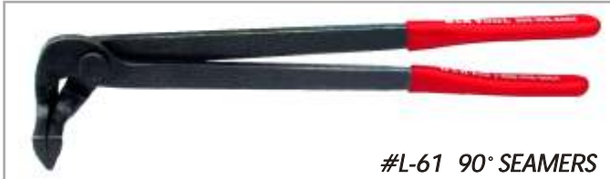
#L-61 90° SEAMERS