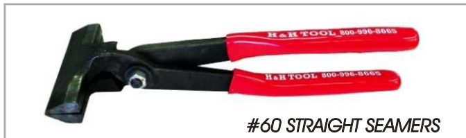
#60 STRAIGHT SEAMERS