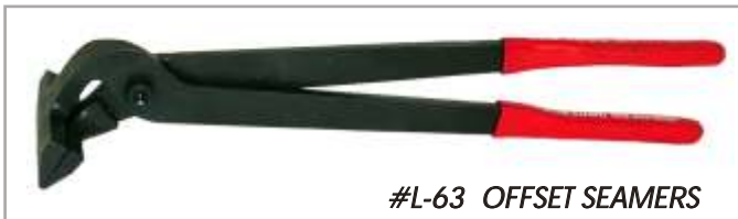
#L-63 OFFSET SEAMERS