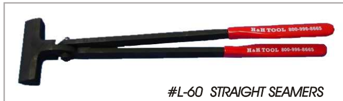
#L-60 STRAIGHT SEAMERS