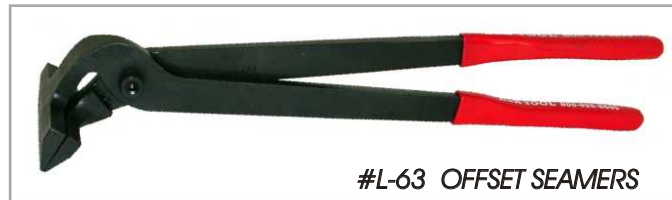
#L-63 OFFSET SEAMERS