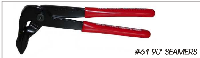
#61 90° SEAMERS