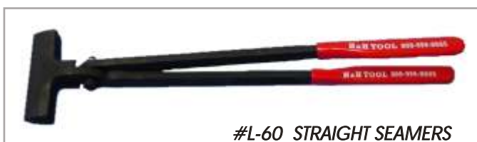
#L-60 STRAIGHT SEAMERS