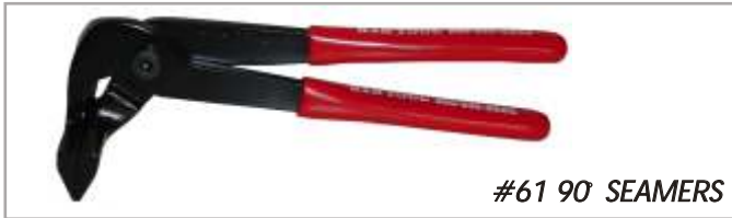
#61 90° SEAMERS